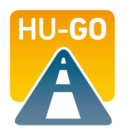
Schedule 6 HU-GO logo